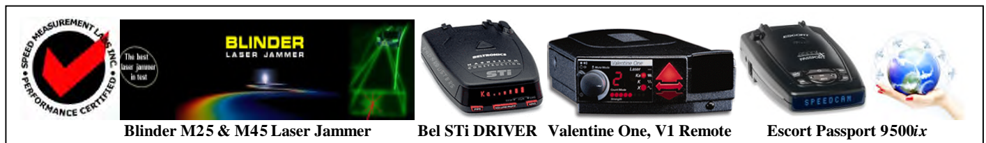
Blinder M25 & M45 Laser Jammer

V-360 warn the driver to check their speed, while the front laser jamming blanks any laser gun display. After the driver safely adjusts speed, the driver should turn the laser jammers off, allowing your new adjusted speed to be detected by the laser gun. Now you appear like an average driver. Once safely through the laser trap, turn the M45 and M25 power back on and continue your trip. Only 1stRadarDetectors and authorized distributors offer this superb, high performance, radar detection, photo detection, photo jamming and laser jamming countermeasure system.