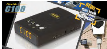
Optional C100 Photo Detector

Speed Measurement Labs (SML) is the industry standard for testing all radar guns, laser guns, detectors, jammers, and has tested our Blinder M25 and M45 laser jammers with #1 performance response. The front radar/laser alerts of the PRS1-