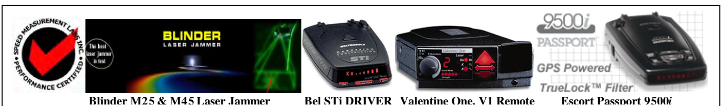
Blinder M25 & M45 Laser Jammer

The front and rear radar/laser alerts of the PRS1-B warn the driver to check their speed, while the front and rear laser jamming blanks out any laser gun display. After the driver safely adjusts speed, we recommend the driver to turn the jammer off until after driving through the laser trap, allowing your new adjusted speed to be detected. Now you appear like an average driver. Once safely through the radar/laser trap, turn the M25 and M45 power back on and continue your trip. Each product has aced the tough, Speed Measurement Lab tests held every year in El Paso, TX. Only Tiger Lily Products and our authorized distributors offer this superb level of radar/photo detection and laser jammer countermeasure system.