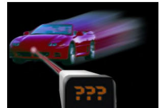
Blinder M45 Laser Jammer, Front