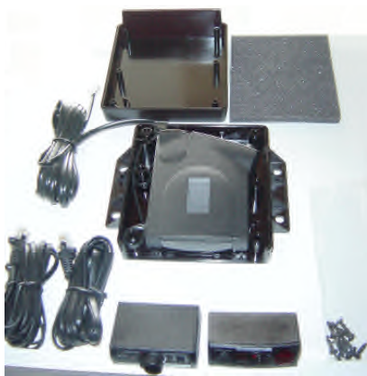
V1 REMOTE FRONT