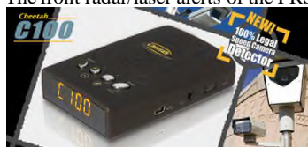
Optional C100 Photo Detector

The front radar/laser alerts of the PRS3-V warn the driver to check their speed, while the front laser jamming blanks any laser gun display. After the driver safely adjusts speed, the driver should turn the laser jammers off, allowing your new adjusted speed to be detected by the laser gun. Now you appear like an average driver. Once safely through the laser trap, turn the M25 power back on and continue your trip. If you want directional radar indicators and laser jamming, the PRS1-V-360 is what you are looking for. Only 1stRadarDetectors and authorized distributors offer this superb, high performance, radar detection, photo detection, photo jamming and laser jamming countermeasure system.