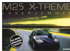
Blinder M25 Front