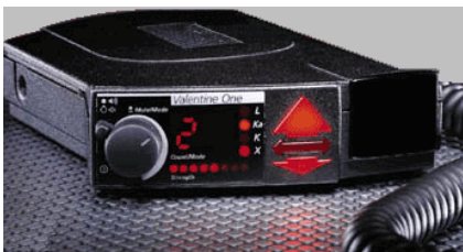
VALENTINE ONE In the Windshield