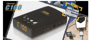
Optional Cheetah C100 Photo Detector

The front and rear radar/laser alerts of the PRS4-V warn the driver to check their speed, while the front and rear laser jamming blanks any laser gun display. After the driver safely adjusts speed, the driver should turn the laser jammers off,