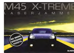
M45, Front and Rear Laser Jamming