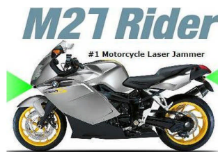
Cheetah M27 Motorcycle Laser Jammer