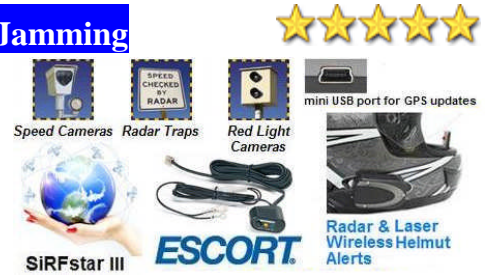
Wireless Helmet Alerts, GPS Updates, Laser Updates

Our PROWLER Remote™ System, PRS4-ixm™ provides 2 high performance, hidden, Cheetah M27 laser Jammer modules combined with a single Escort 9500ix Radar detector. The Escort 9500ix is the only radar detector that offers GPS memory location packaged with radar detection, voice alerts, L, X, Ku, K, Ka, POP3, and Photo Speed Camera radar detection. And the 9500ix will alert you if you go over a preset speed limit. It is 100% invisible to VG2, the new VG4 and Spectre II RDD (radar detector detectors), but can be detected by Spectre III, IV and IV+, and Stalcar RDD (used in Australia). Front radar detection is provided with a brilliant blue matrix LED display, which also indicates your speed. Frequency of the radar band can also be displayed, along with audio/visual/voice alerts. Our Cheetah M27™ Laser Jammer is #1 in the world to defeat/detect every known laser gun made. Two laser jammer modules, 1 front and 1 rear, detect front and rear laser guns. The 9500ix, Cheetah M27, Wireless Helmet Display for radar and laser is provided. The PRS4-ixm™ provides a 5+ star performance rating.