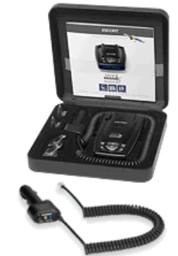
Travel Case, Smart Cord, Windshield Mount & Suction Cups Included