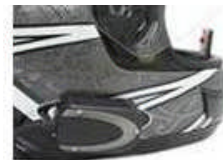
Radar & Laser Wireless Helmet Alerts