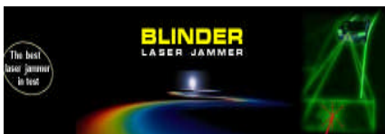
Blinder M27 & M47 Laser Jammer