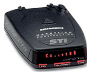
Bel STi Driver