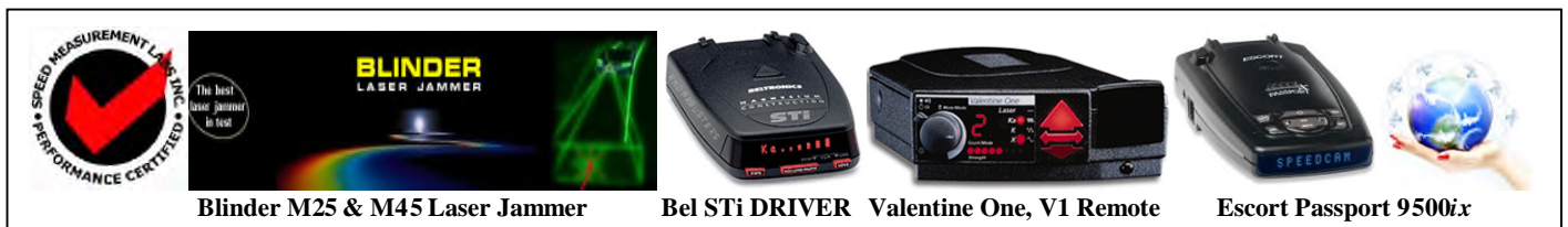
Blinder M25 & M45 Laser Jammer

The radar/laser alerts of the Passport 9500ix radar detector with red display are combined with the M45 laser jammer to blank any laser gun display. After the driver safely adjusts speed, we recommend the driver to turn the jammer off until after driving through the laser trap, allowing your new adjusted speed to be detected. Now you appear like an average driver. Once safely through the radar/laser trap, turn the M45 power back on and continue your trip. Only 1stRadarDetectors and its authorized distributors offer this ultimate, high level, radar and photo detection and laser jammer countermeasure system.